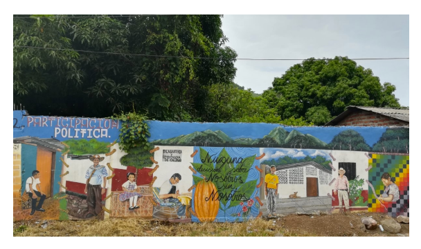
Photograph by Dáire McGill: Political participation mural in Municipio La Paz, Cesar (2019)